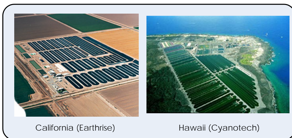
Figure 6: Intensive production of spirulina facilities in the United States of America