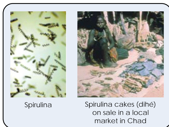
Figure 1: Spirulina and its sales as dried cakes in Chad

Spirulina are multicellular and filamentous blue-green algae that has gained considerable popularity in the health food industry and increasingly as a protein and vitamin supplement to aquaculture diets. It grows in water, can be harvested and processed easily and has very high macro- and micro-nutrient contents. It has long been used as a dietary supplement by people living close to the alkaline lakes where it is naturally found – for instance those living adjacent to Lake Chad in the Kanem region have very low levels of malnutrition, despite living on a spartan millet-base diet. This traditional food, known as dihé , was rediscovered in Chad by a European scientific mission, and is now widely cultured throughout the world. In many countries of Africa, it is still used as human food as a major source of protein and is collected from natural water, dried and eaten. It has gained considerable popularity in the human health food industry and in many countries of Asia it is used as protein supplement and as health food.