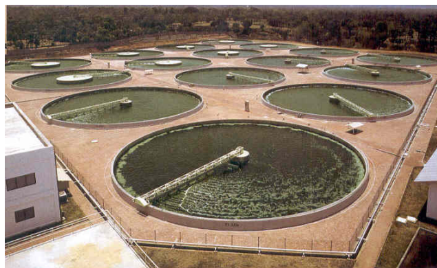
Figure 5: A standard design for industrial production of spirulina