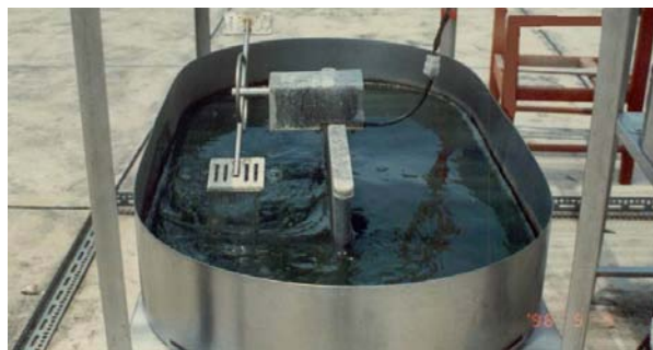
Mini high rate algal Tank, Institute of Post-graduate Studies & Research, University of Malaya, Kuala Lumpur, Malaysia (photo courtesy: S.M. Phang).

Faintuch, Sato and Aguarone (1991) also studied the influence of the nutritional sources on the growth rate of cyanobacteria. They reported that there is very significant influence of mixtures of defined proportions of \text{KNO}_3 , urea and ammonia-N on the growth of Spirulina maxima . The most favourable growth rates of S. platensis occurred in the presence of 2.57 g/litre \text{KNO}_3 with growth rate of 0.3–0.4/day. Chang et al. (1999) studied the possibility of using nitrifying bacteria for the fulfillment of nitrogen fertilizer in spirulina mass culture. They first adapted the nitrifying bacteria with pH 8–10, 0.6–2.2 percent salt and 6–12 mg/litre of \text{NaHCO}_3 in the culture solution. They found that the concentration of \text{NO}_3\text{-N} reached over 20 mg/litre after the nitrifying bacteria was inoculated in the spirulina culture solution and then incubated for 6 days at 25–35 °C.